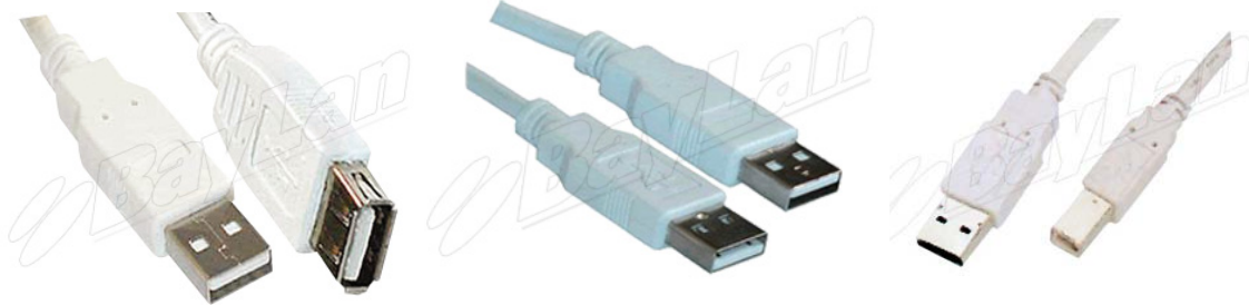
A Male /A Female Extender